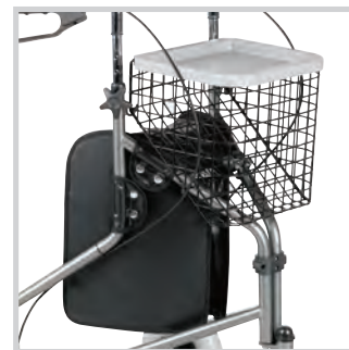
Optional basket and tray